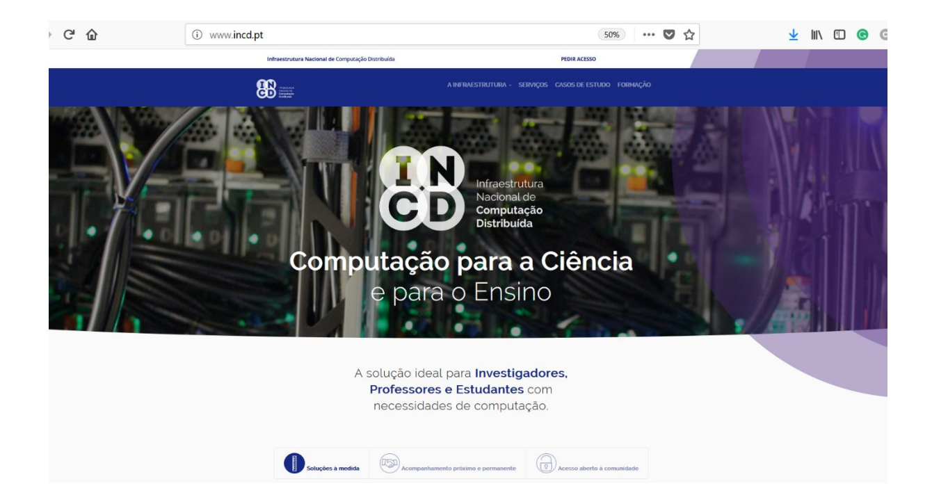
Figure 1 Homepage of the INCD website

A new website was designed and implemented, with new contents and practical information.