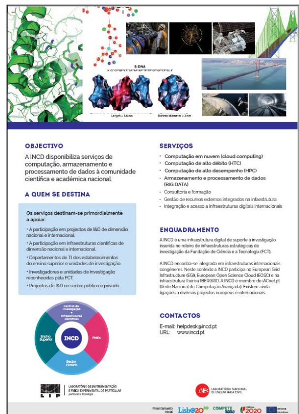
Figure 4 INCD first brochure. Left: front; Right: back.

The new brochure, developed taking into account the actual website design and key messages of the INCD communication strategy: