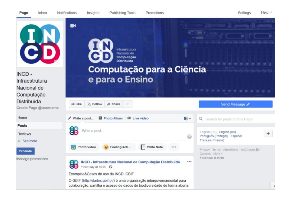
Figure 2 Facebook page of INCD.

https://www.linkedin.com/company/incd-pt/